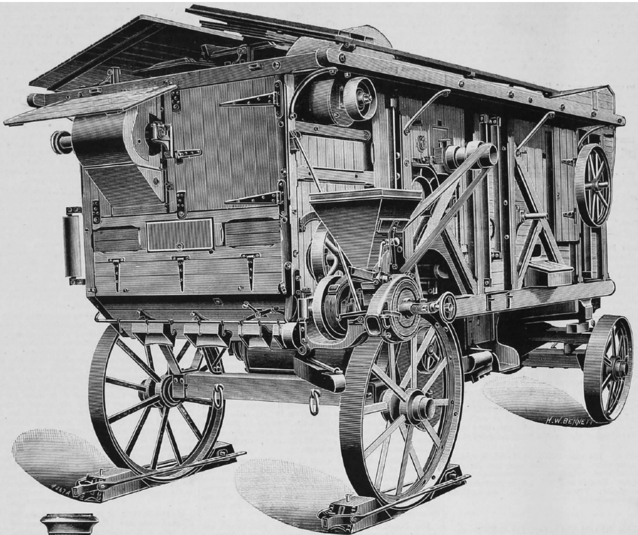
THRASHING MACHINE, BY MESSRS. CLAYTON AND SHUTTLEWORTH, LINCOLN.